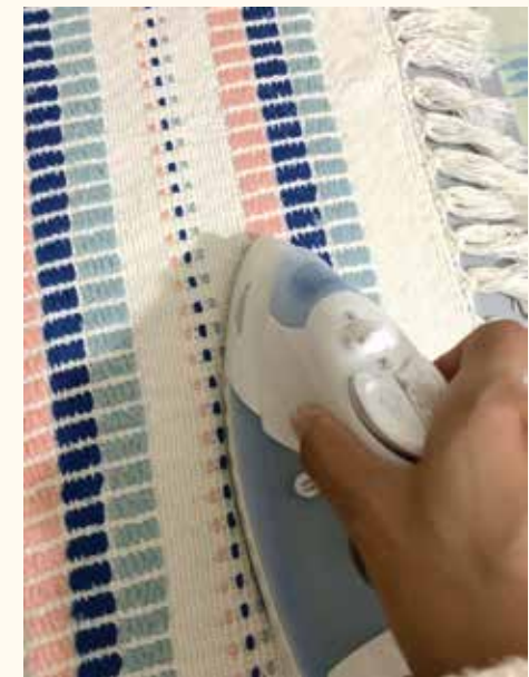
Image D. Lint can easily be removed by ironing and using a lint roller.