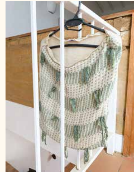
Image B. Air drying using a clothes hanger.