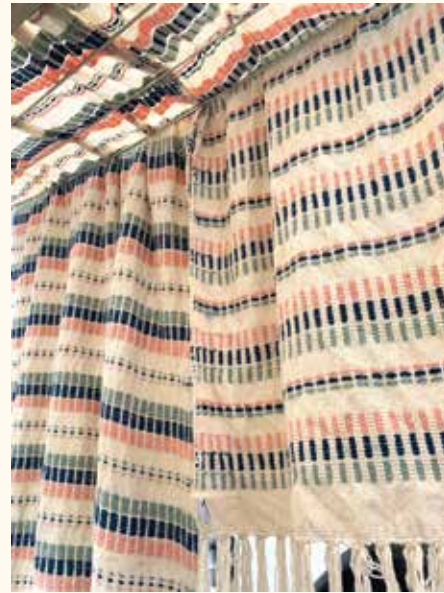
Image A. Air drying by spreading textile over hanging rack.